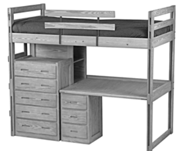
4305L (Ladder left)