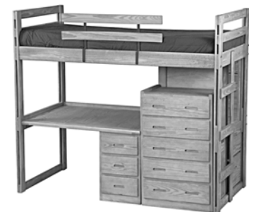
4305R (Ladder right)